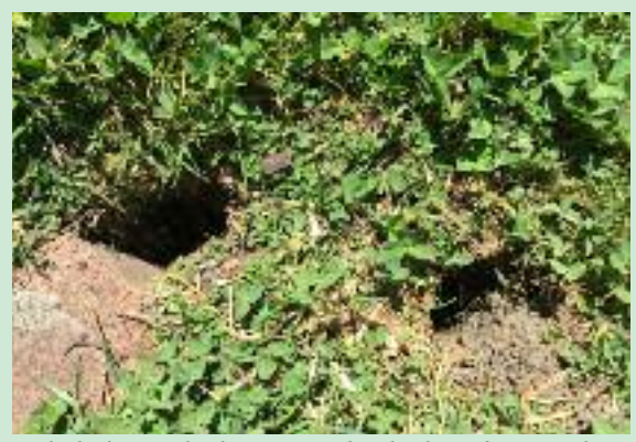
Vole holes in the lawn must be dealt with to eradi cate these destructive creatures.

THANKS for all the wonderful comments about my last Digging Deep column, Paradise Found. Special thanks to Lamorinda Weekly reader, Sydney, who shares this tip about growing her 65-year-old spectacular peony: When winters are mild, put ice cubes around the base of your peonies. Prune stems low to a bud in January. Fertilize with fish emulsion and deadhead after blooms are spent in April.